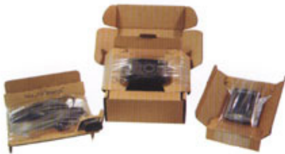
FlexNStretch™ Suspension Packs

FlexNStretch™ Suspension, Slingspring and Inclosure packs are all designed to deliver the specific product protection that is needed without the storage, environmental, labor, ease of use or cost problems associated with traditional die-cut foam packs, molded foam packs, instant-foam packs, end-cap type suspension packs, or corrugated clamping retention packs. Whether you're shipping laptops, PDA's, picture frames, hard-cover books, monitors, disc drives, glassware, modems, or any other type of fragile product, you can count on FlexNStretch packs to deliver what you need!