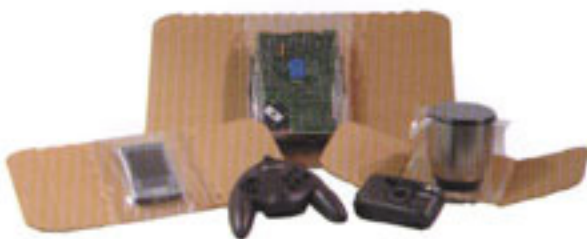
FlexNStretch™ Inclosure Packs