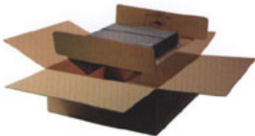
FlexNStretch™ Slingspring Packs